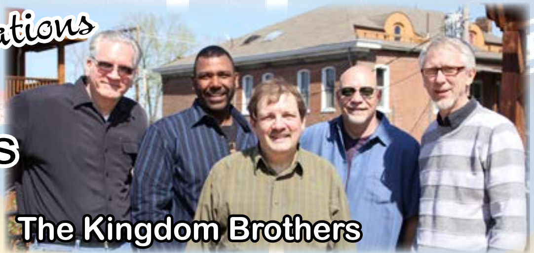
The Kingdom Brothers