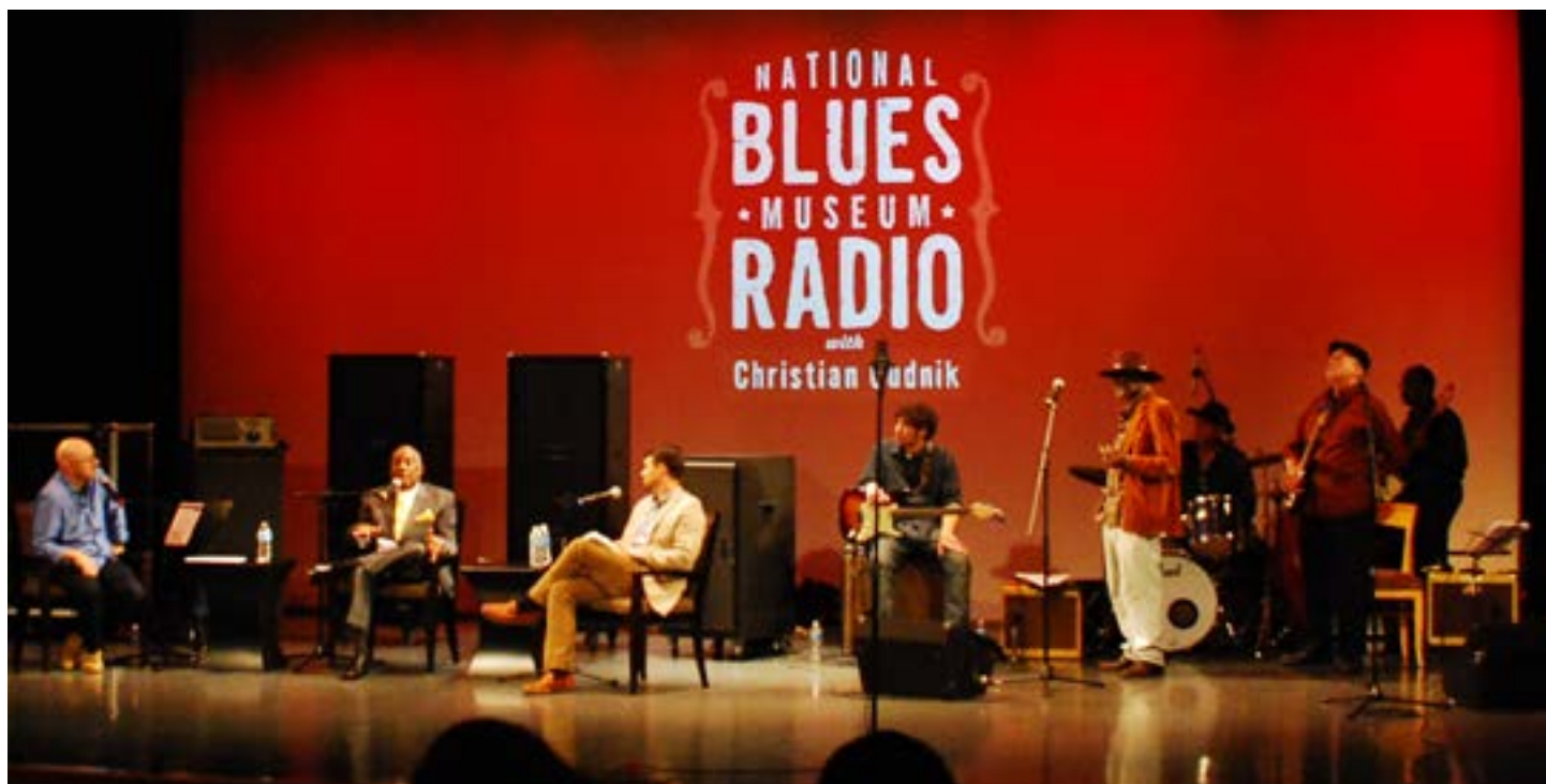
The St. Louis Blues Society BluesLetter 5